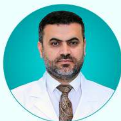
Fahmi Kakamad Smart Health Tower (Iraq)